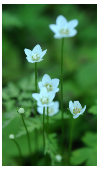
Grass-of-Parnassus Parnassia palustris