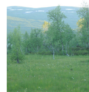
Mountain birch. On Stiehpaltjåhkkå there's sloping marshland.

forget-me-not, moorland spotted orchid, wood cranesbill, globeflower, northern wolfsbane and not least mountain avens. Animals: Golden eagle, white-tailed eagle, rough-legged buzzard, willow grouse, golden plover, bluethroat, mountain finch, fox, hare and elk live in the area. In rare cases lynx, wolverine and marten can be seen in the woods. Semisjaur-Njarg Sámi association carry out reindeer husbandry here. Source: INSARC/The Silver Museum www.recallingthepast.se