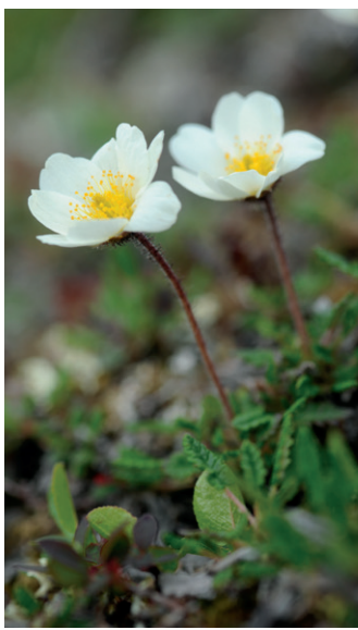
Grows in abundance by the top of Stiehpaltjåhkkå – mountain avens Dryas octopetala.