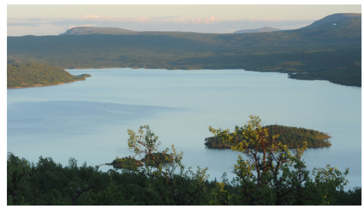
View to the south: Sädvvájávrre is located in the upper part of the Skellefte River and is used as a reservoir. The lake has been dammed in several stages in 1942, 1953 and 1985. The water level varies between 460.70 and 470 m.a.s.l. The volume of the reservoir is 605 million m3.